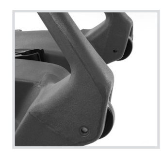
Two front panel roller wheels assist in loading and unloading from a transport vehicle.