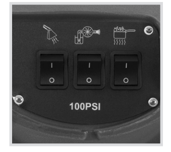
Recessed electronic switch plate protects switches from solution tank and reduces water exposure.