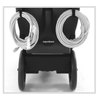
Molded wand caddy for easy transport.