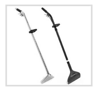
The EX20<sup>™</sup> comes standard with a 12 inch stainless steel wand. The AquaWand<sup>™</sup> is an optional upgrade.