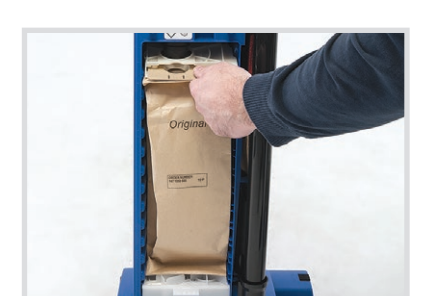
Quick change filter bag with convenient spare bag storage.