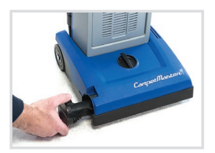
Tools-free access to remove brush.