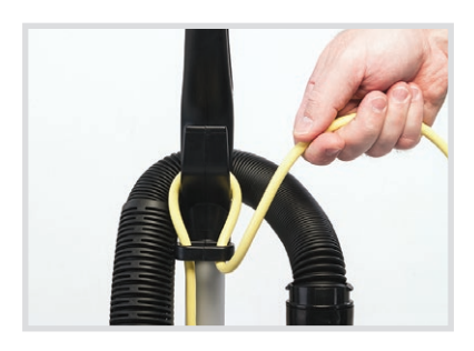
Cord restraint protects against cord abuse.