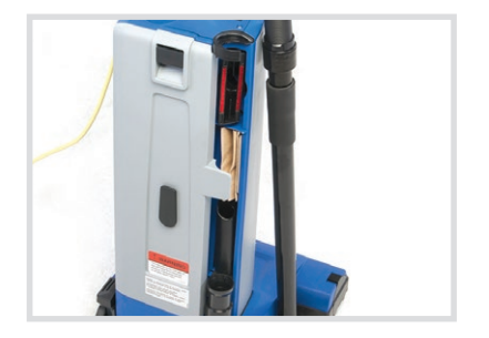
Accessories are conveniently tucked behind the vacuum wand.