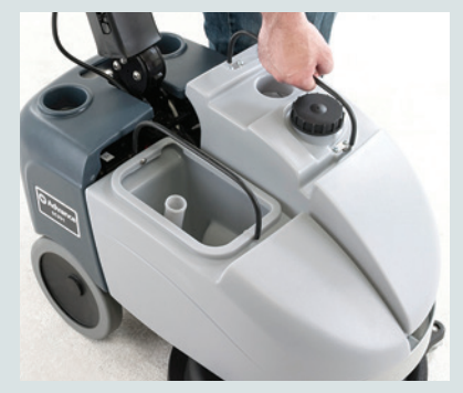
Easily remove the recovery and solution tanks to fill, drain and clean them away from the machine.