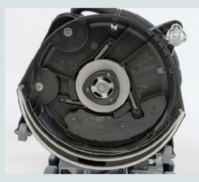
The SC351™ squeegee system provides increased vacuum performance for better water pick-up. The tools-free squeegee can be easily and comfortably removed for cleaning.

The SC351's easily accessible, removable 3 gallon recovery tank and a 2.5 gallon solution tank ensure minimal equipment maintenance. Don't mess with timely tank cleaning, instead, remove the tanks to quickly fill, drain and clean them away from the machine itself. Further, all machine components are accessible without the need for tools—including the squeegee.