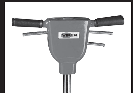
Easy-to-use, fingertip controls.