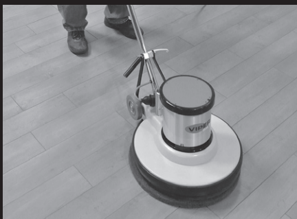
Engineered to withstand heavy, daily use in commercial settings.