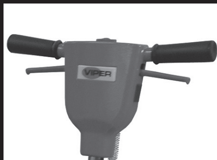
Easy-to-use, fingertip controls.