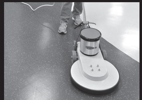
High cleaning productivity rate.